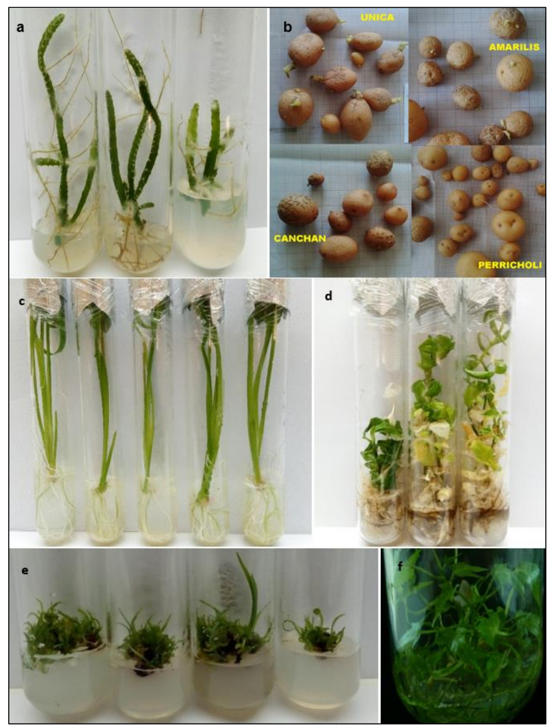
Figure 3. Plant propagation and germplasm conservation. a. Clonal propagation of Hylocereus megalanthus , b. Midi-tubers of several varieties of potato, c. Somaclonal variants of rice, d. Germplasm conservation of Ficus sp. e. Somaclonal variants of sugarcane and f. In vitro propagation of sweet potato.

Since the great famine in Ireland that killed more than a million people due to Phytophthora infestans (Late Blight) infestation on potato crops ( Callaway , 2013), there have been many other diseases and infestation identified that affect potato tubers in various proportions. These diseases are caused by bacterial, fungal and viral pathogens such as Streptomyces spp. (Common Scab), Alternaria solani (Early blight), Fusarium spp. (Fusarium Dry Rot),