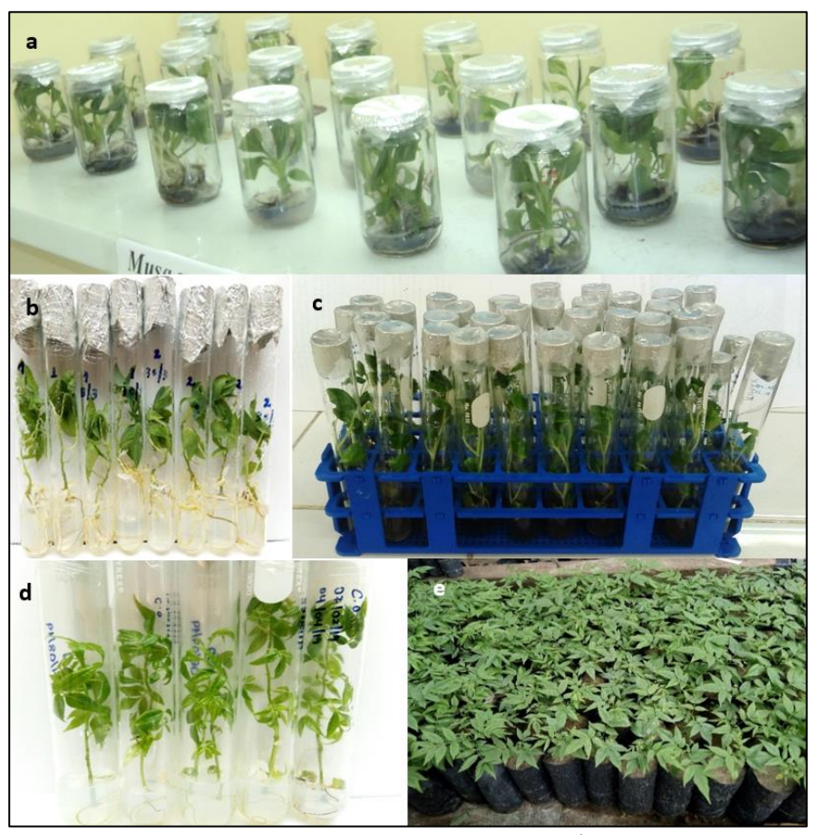
Figure 1. Plant propagation and germplasm conservation. a. Musa sp. b. Manihot esculenta, c. Piper tuberculatum, d. Cedrela odorata (in vitro plants) and e. C. odorata (mass propagation).

Our study suggests that in vitro germination not only makes it possible to achieve higher germination rates (95% to even 100%,), but also accelerate the reproduction by reducing germination time up to 60%. Additionally, using genetically resistant type material can help minimize the occurrence of bacterial and fungal diseases, both, superficial and endogenous. In in vitro cultures using clonal propagation of C. odorata , from node explants of the juvenile shoots, was reached using a MS basal medium supplemented with 2.0 mg/L<sup>-1</sup> BAP and 3.0 mg/L<sup>-1</sup> NAA.