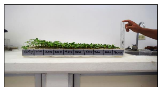
Figure 3. Effect of 60Co gamma irradiation on survival in sunflower seedlings ( Helianthus annuus L.). Universidad Tecnológica de Tehuacán. 2017.

Survival percentage was a consequence of germination and sprouting together, having a third order polynomial behavior (Figure 2), and whose coefficient of determination was high 0.99 and highly significant. As the radiation dose increased from 200 to 900 Gy, the percentage of survival decreased, indicating that the sunflower is a sensitive species at high levels of radiation, thus in this way the application of 500 Gy decreases survival by 54.9% (Figure 3). This same response was found in Polianthes, where the percentage of survival, decreases, by increasing the radiation dose from 10 to 30 Gy, despite being a tuberous plant (Estrada et al., 2011). In contrast Lemus et al. (2002), worked with two varieties of vigna bean (Vigna unguiculata L.), in similar ranges of irradiation, found that the application of 600 Gy, causes a drastic fall in the percentage of survival. This response to gamma irradiation was also studied by Ramírez et al. (2006), who when working with tomato seeds (Lycopersicum esculentum Mill.), mention that the first effects of gamma radiation, affect physiological processes such as germination and seedling growth, submitted to these agents and report, then in tomato, the germination begins to decrease in 500 Gy, checking what was found in this investigation.