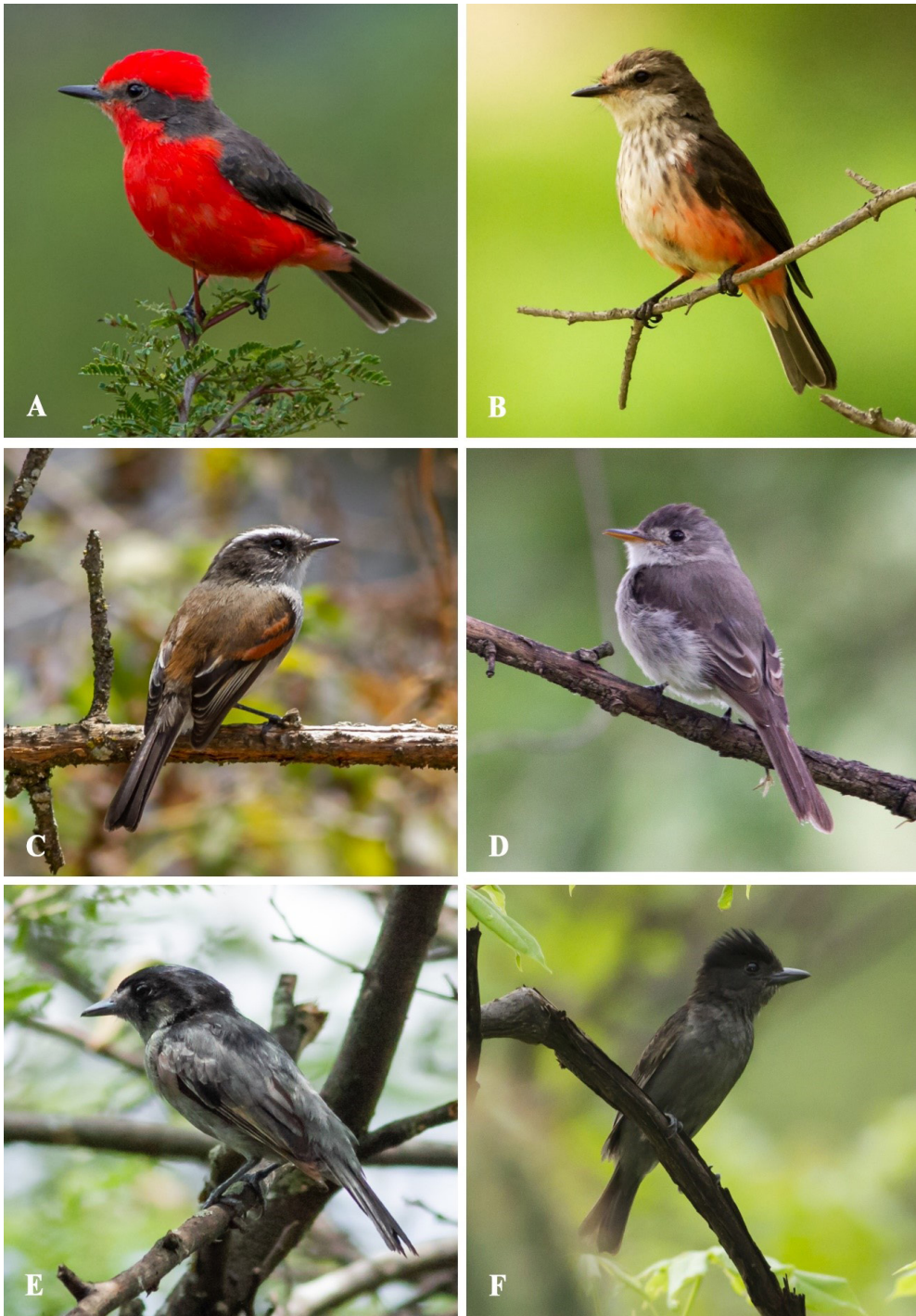
Fig. 6. A. Pyrocephalus rubinus piurae (east, male); B. Pyrocephalus rubinus piurae (east, female); C. Ochthoeca piurae (endemic); D. Contopus punensis ; E. Pachyramphus spodiurus (male); F. Pachyramphus homochrous homochrous (male).