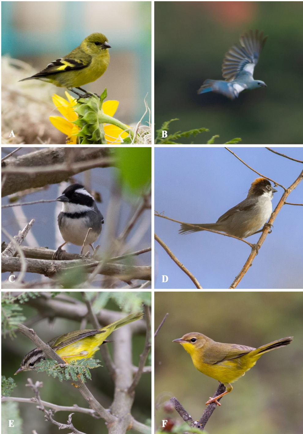
Fig. 10. A. Spinus magellanicus ; B. Tangara episcopus caerulea ; C. Arremon abeillei ; D. Atlapetes leucopterus dresseri ; E. Basileuterus trifasciatus (east); F. Geothlypis auricularis (east).