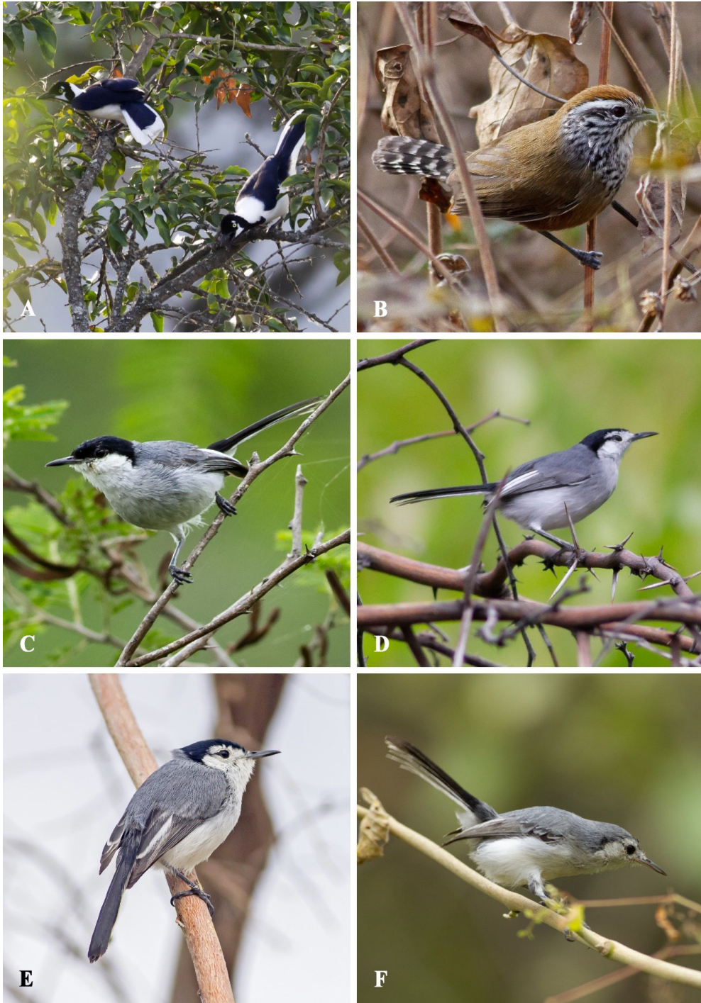
Fig. 7. A. Cyanocorax mystacalis ; B. Pheugopedius paucimaculatus ; C. Polioptila maior (endemic, male); D. Polioptila maior (endemic, female); E. Polioptila plumbea bilineata (male); F. Polioptila plumbea bilineata (female).