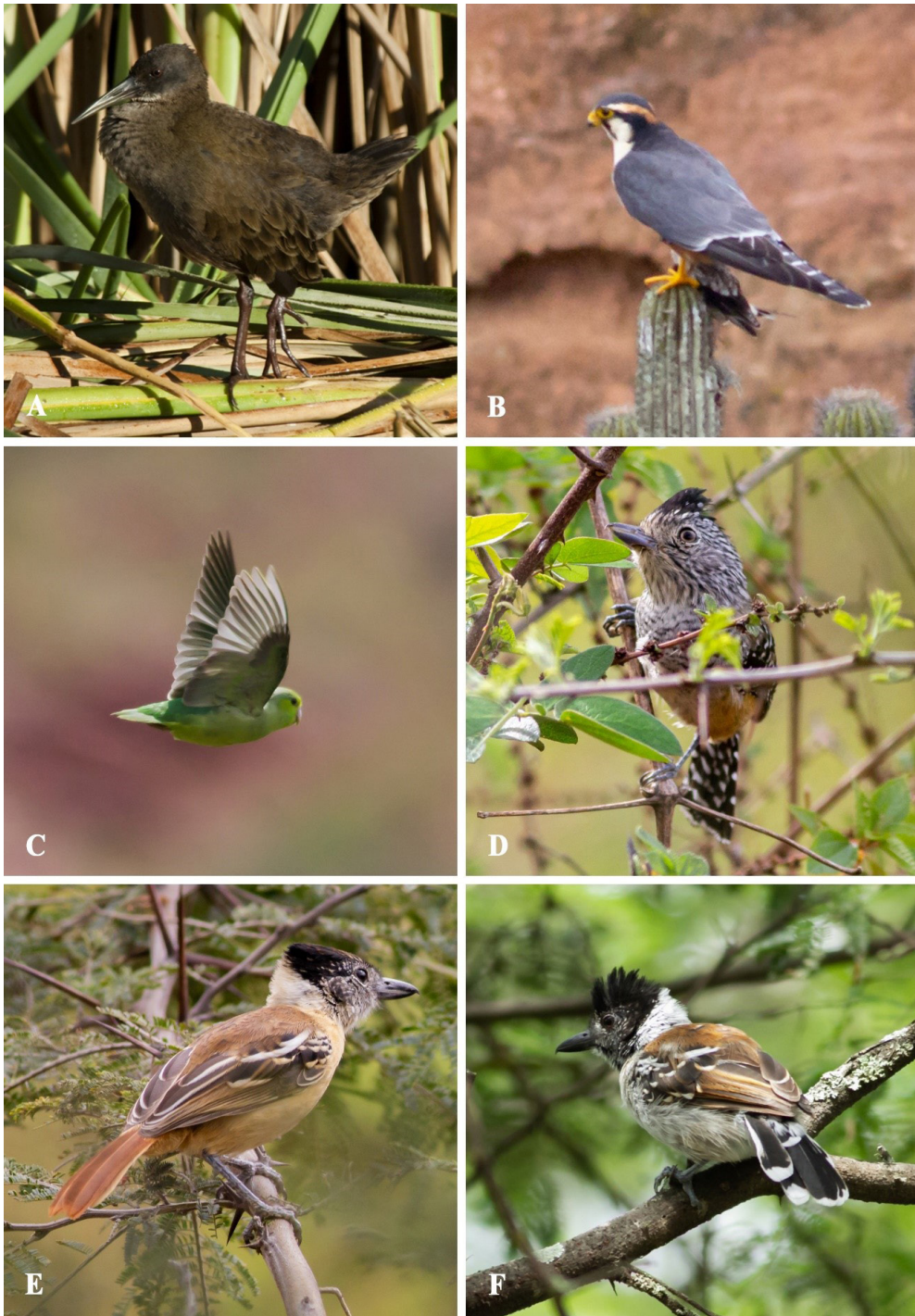
Fig. 4. A. Pardirallus sanguinolentus simonsi (juvenile); B. Falco femoralis pichincha ; C. Forpus coelestis (female); D. Thamnophilus zarumae palamblae ; E. Thamnophilus shumbae (endemic, female); F. Thamnophilus bernardi (male).