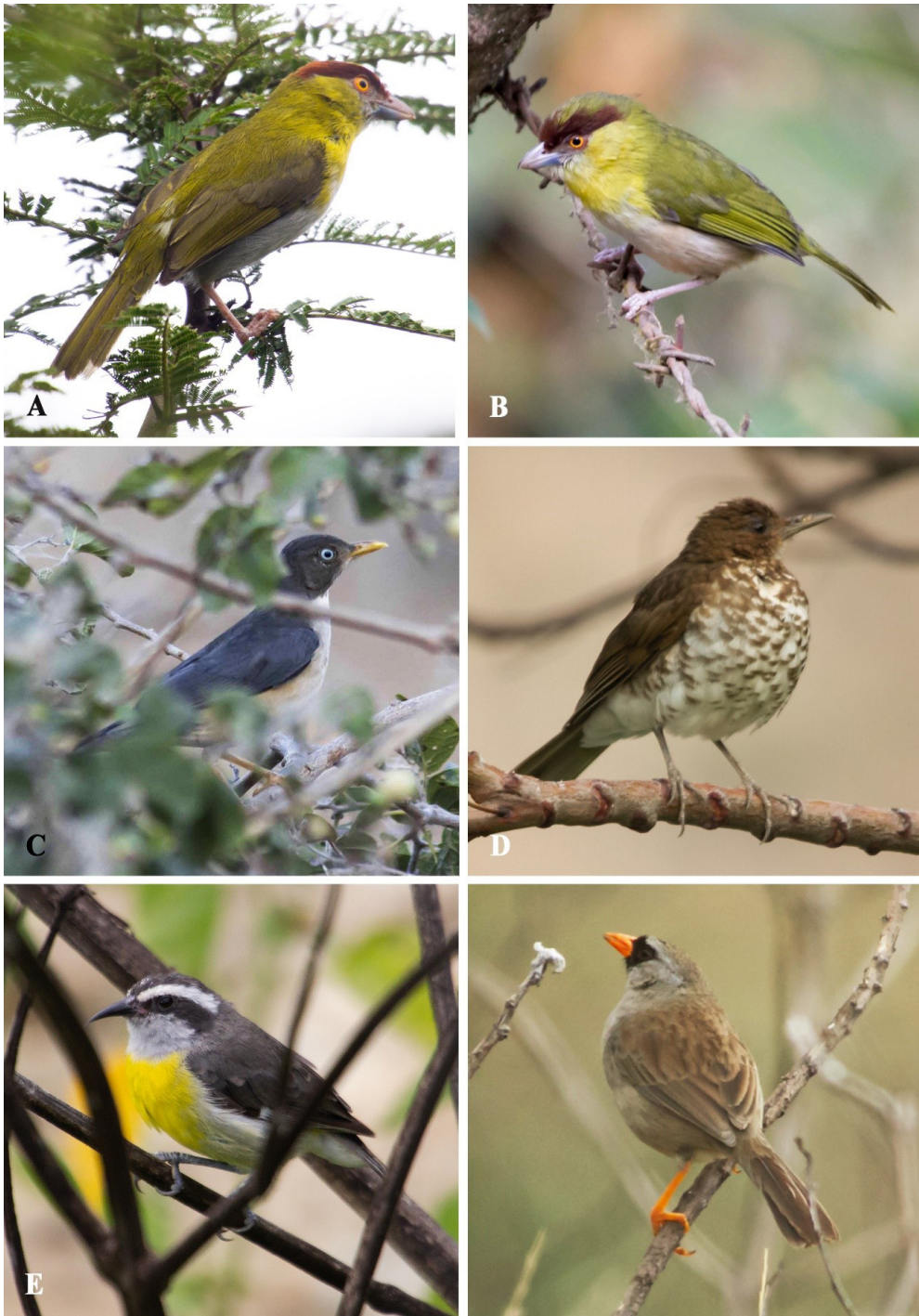
Fig. 8. A. Cyclarhis gujanensis saturata/contrerasi ; B. Cyclarhis gujanensis virenticeps ; C. Turdus reevei ; D. Turdus maranonicus ; E. Coereba flaveola magnirostris ; F. Incaspiza ortizi (endemic).