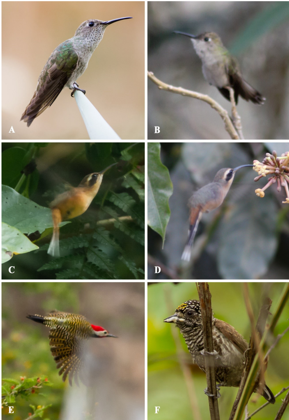
Fig. 3. A. Leucippus taczanowskii (endemic); B. Leucippus baeri ; C. Phaethornis griseogularis zonura ; D. Phaethornis porcullae ; E. Colaptes atricollis peruvianus (endemic); F. Picumnus sclateri porcullae (male).