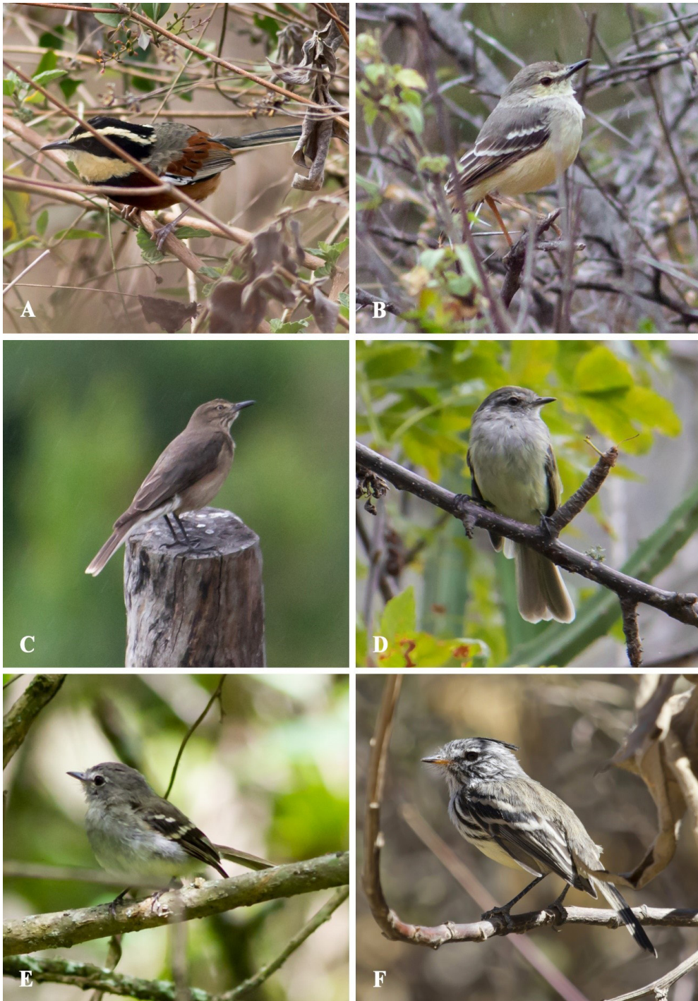
Fig. 5. A. Melanopareia elegans paucalensis (male); B. Muscigralla brevicauda (east); C. Agriornis montana ; D. Myiopagis subplacens ; E. Lathrotriccus griseipectus ; F. Anairetes flavirostris huancabambae .