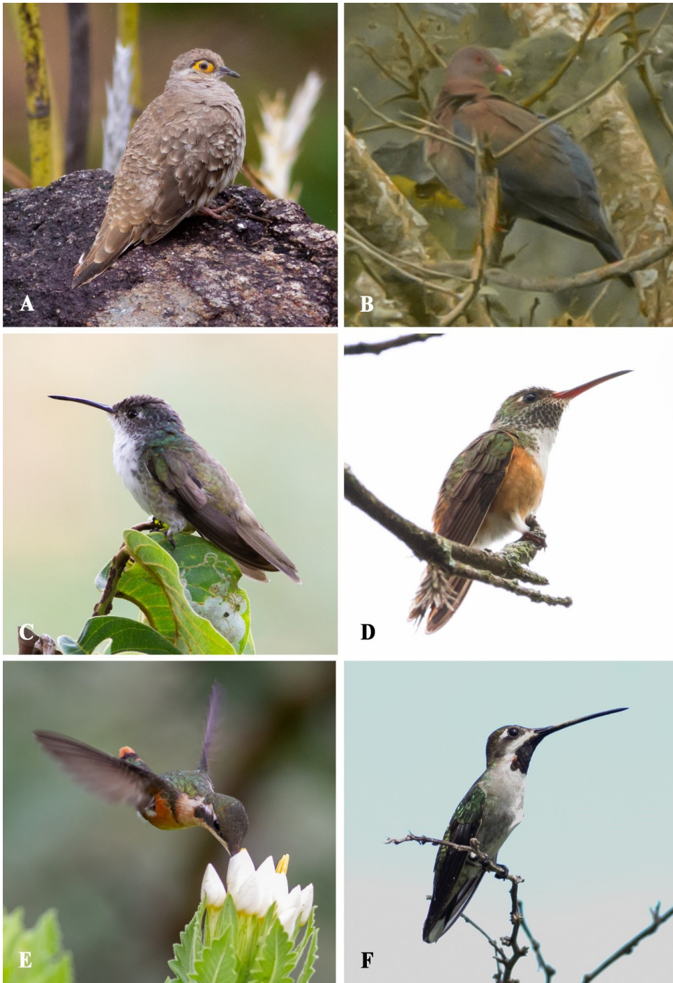
Fig. 2. A. Metriopelia ceciliae (east); B. Patagioenas oenops ; C. Amazilia franciae cyanocollis (male); D. Amazilia amazilia leucophaea (east); E. Chaetocercus mulsant (female, east); F. Heliomaster longirostris albicrissa .