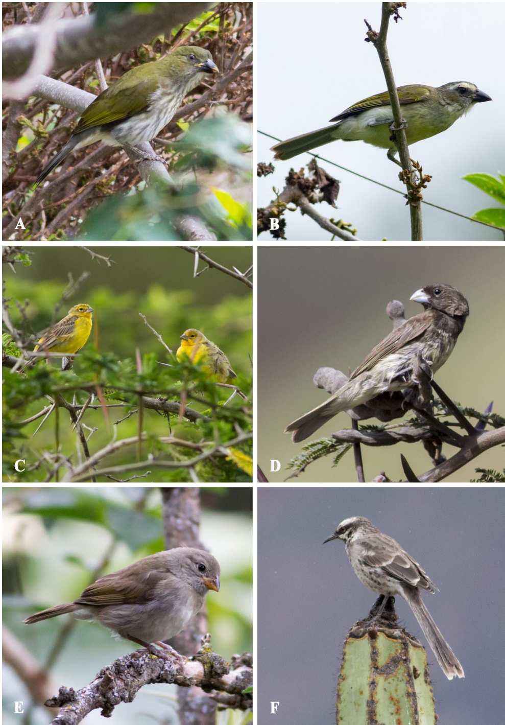
Fig. 9. A. Saltator striatipectus peruvianus ; B. Saltator striatipectus immaculatus ; C. Sicalis luteola bogotensis ; D. Sporophila nigricollis inconspicua (male); E. Asemospiza obscura pauper ; F. Mimus longicaudatus (east).