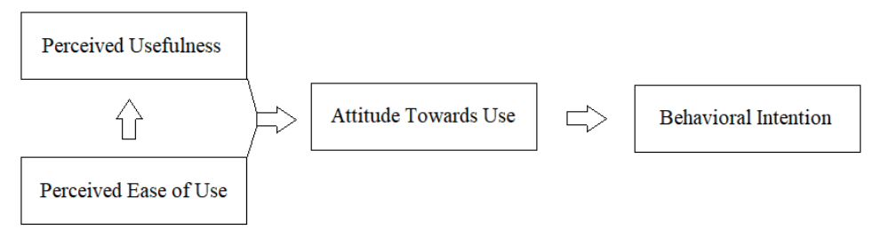
Figure 1 Graphic representation of the relationships proposed by TAM

Note. Elaborated with data taken from "Perceived usefulness, perceived ease of use, and user acceptance of information technology", by F. D. Davis, 1989, MIS quarterly, 13 (3), pp. 319-340 (https://doi.org/10.2307/249008).