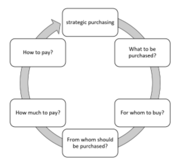
Figure 1. Conceptual model of strategic purchasing of health services, according to the World Health Organization.

Strategic purchasing is the active and evidence-based interaction to achieve the major health goals via increasing the volume and quality of services provided<sup>(1)</sup>. This type of purchase in the health system seeks to find effective, high quality, and cost-effective services from the best providers. The best framework for evaluating the performance of strategic purchasing is the model presented by the World Health Organization (WHO) in the report published in 2000 (Figure 1) that is accepted by all health care system researchers and health policy makers around the world. This framework can be used to assess the status of quality in strategic purchasing<sup>(4)</sup>.