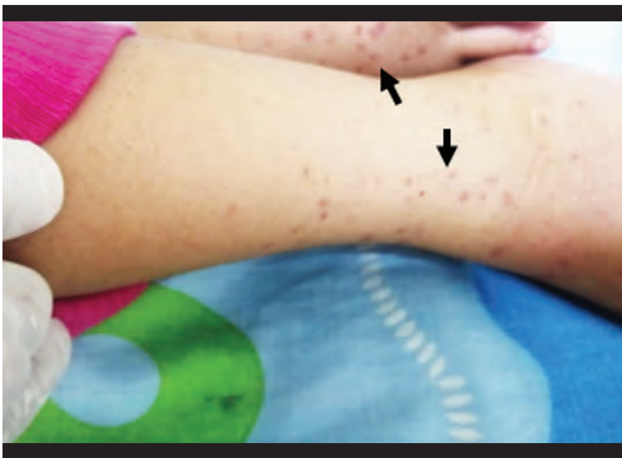
Figure 3. On day five of hospitalization, purpuric lesions in lower limbs in remission.