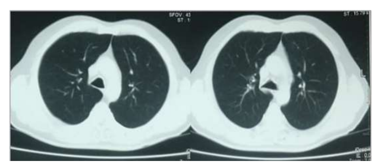
Figure 2: Computed tomography of the chest in the lung window where no tomographic signs of a parenchymal lesion suggestive of tuberculosis are observed.