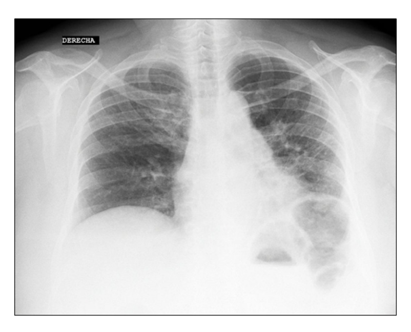
Figure 1. Chest X-ray showing a diffuse ground glass pattern in the lower 2/3 of both lung fields.

A 63-year-old woman, married, housewife, from the Peruvian Amazon. She has no pathological history. The patient denies smoking and alcoholism. Sporadic dry cough began, without fever or weight loss. The cough persisted and became chronic over time. Eight months after the onset of the symptoms, progressive tiredness and fatigue appeared, so she went to the hospital where a physical examination of the respiratory system revealed diffuse velcro-type crackles in the lower 2/3 of both lung fields. The chest X-ray confirmed pulmonary fibrosis, in a ground glass pattern (figure 1).