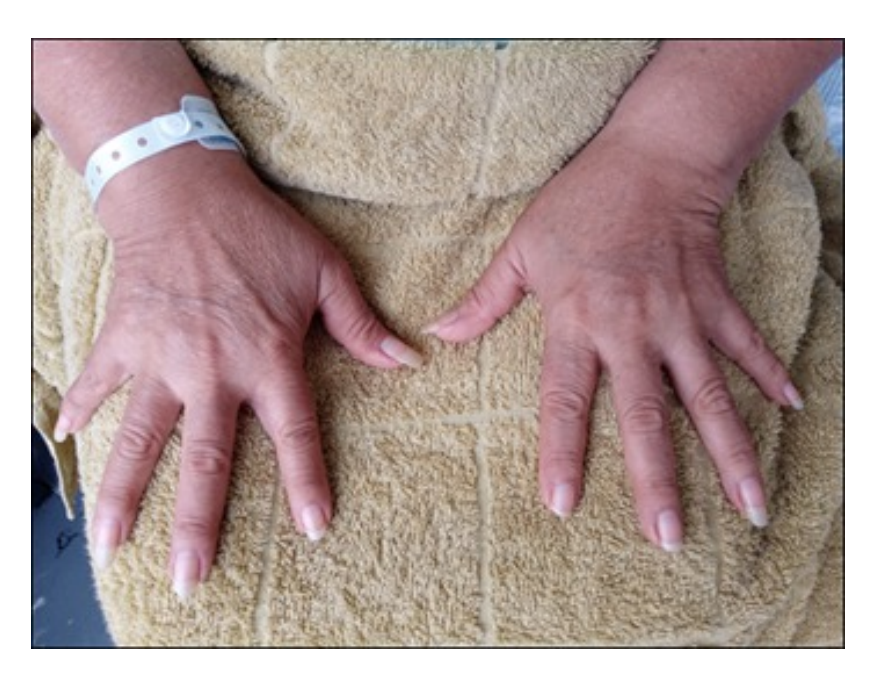
Figure 3. In addition to Raynaud's phenomenon, there was no evidence of proximal or distal skin involvement in both hands.

The patient begins progressive improvement of the pulmonary and digestive symptoms. Currently, it is with