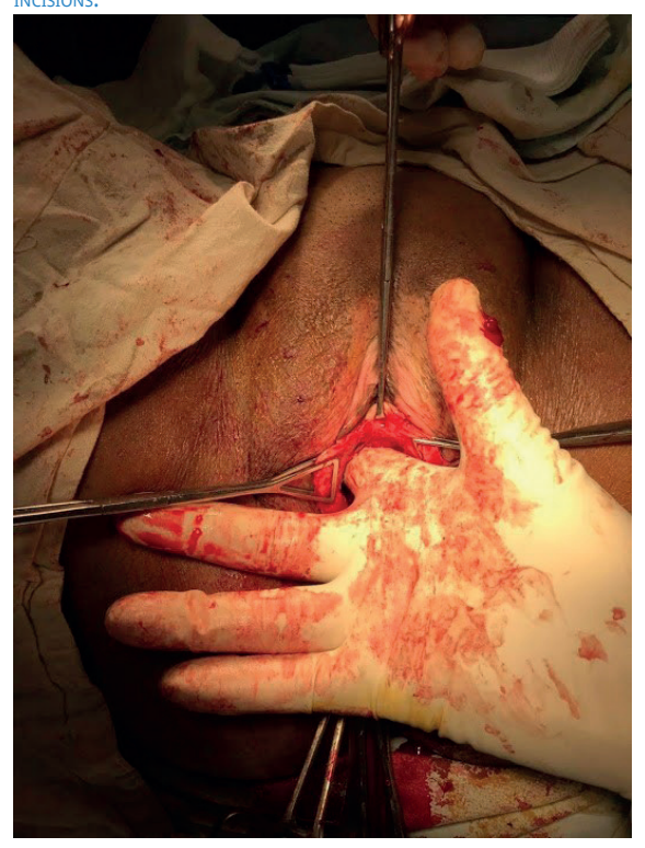
FIGURE 2. INTRODUCING THE INDEX FINGER TO DISSECT THE TISSUE UNTIL IT REACHES THE PUBIC SYMPHYSIS, BILATERALLY. THERE ARE NO INGUINAL