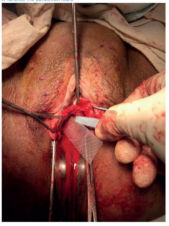
FIGURE 4. THE SAME IS DONE ON THE OTHER SIDE. IF IT IS TOO LONG, CUT THE SUBURETHRAL TAPE.