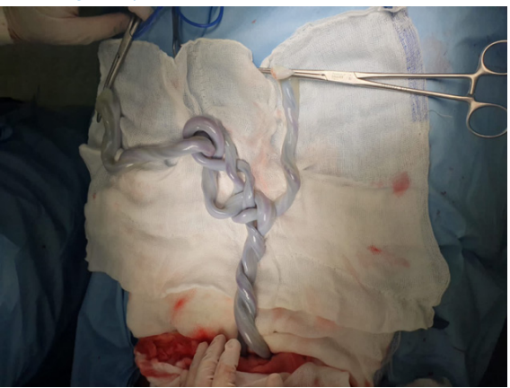
FIGURE 6. POSTNATAL EVALUATION SHOWING THE PROXIMITY BETWEEN THE PLACENTAL INSERTIONS OF THE UMBILICAL CORDS.

FIGURE 5. POSTNATAL EVALUATION SHOWING UMBILICAL CORD INTERTWINING AND ENTANGLEMENT.