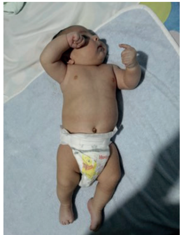
FIGURE 4. SURVIVING TWIN AT THE THIRD MONTH OF LIFE.

Among the therapeutic options, the use of intrafetal ablation techniques is currently preferred, among which radiofrequency ablation (RFA) - a procedure not yet available in Peru - and intrafetal laser ablation stand out. The latter is a simple, safe, effective and more accessible tech-