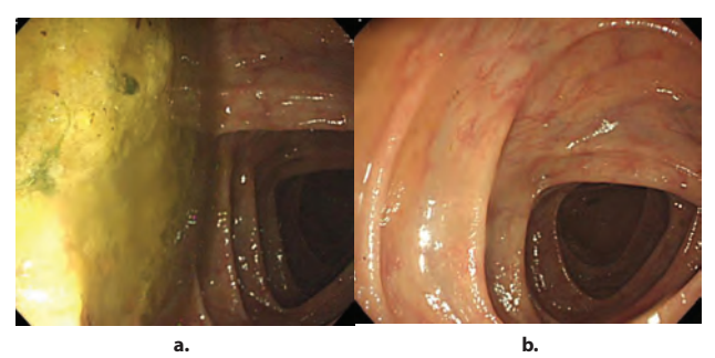
Figure 3a-b: Endoscopic findings in cases receiving endoscopic lavage of about 200 mL of solution permitted colonoscopy a: Before lavage, b: After lavage.

The ascending colon is not often clean after performance of Golytely (electrolyte-polyethylene glycol solution) lavage<sup>(1)</sup> or the modified Brown method<sup>(2)</sup> which are mainly used in Europe, despite ingestion of 3,000 to 5,000 mL of water. There is a clear difference in diet between the Japanese and Europeans and a remarkable difference in the amount of consumption of dairy products, even today. The 1,000mL Magcorol P® method was performed for 6 Europeabs who consumed large amounts of dairy products in order to determine its efficacy in them. An extremely effective colonic cleansing was observed. Some of these patients were allowed to consume beer instead of the 1,000 mL of fluid after dinner on the preceding day and the effect of this was as satisfactory as when taking water. These findings strongly suggest that the 1,000-mL Magcorol P® method used in this Japanese study could also be applied to Europeans.