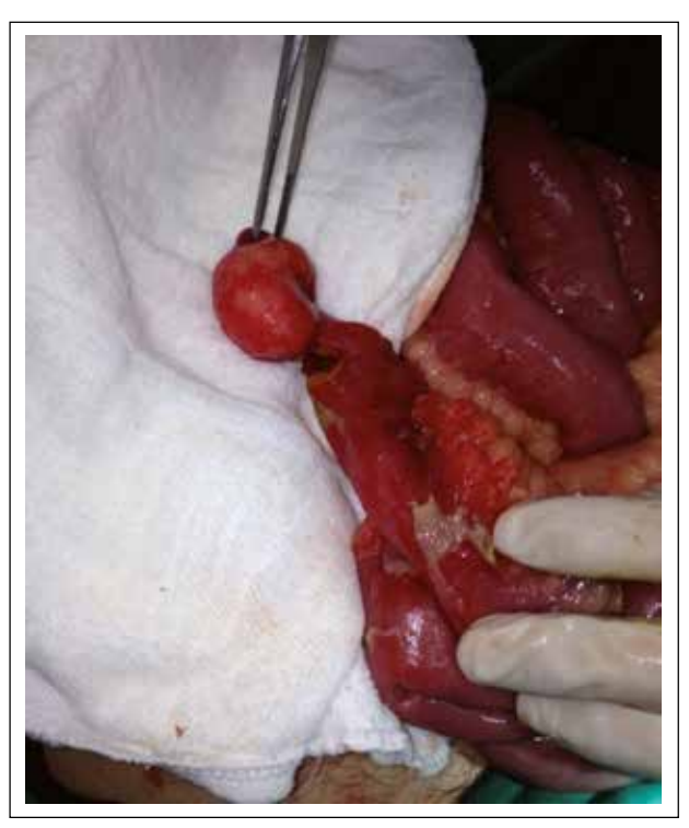
Figure 2. Perforated Meckel's diverticulum located about 60 cm from the ileocecal valve.

The description of Meckel's diverticulum of origin occurred in 1809 by Johann Friedrich Meckel,