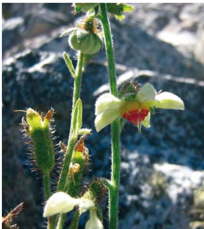
Figure 4. Flower of Nasa sanagoranensis sp. nov. (A. Cano & N. Valencia 18448).