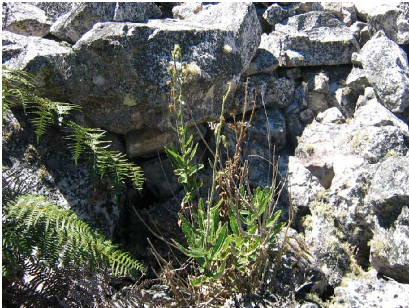
Figure 3. Habitat and habit of Nasa sanagoranensis sp. nov. (A. Cano & N. Valencia 18448)