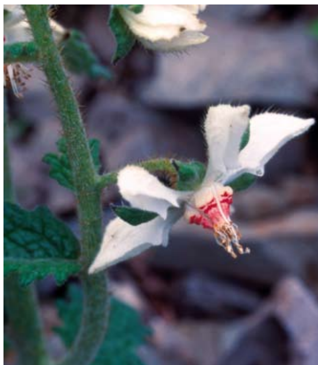
Figura 5. Flower of Nasa carunculata (Urb. & Gilg) Weigend (M. Weigend et al. 5035).