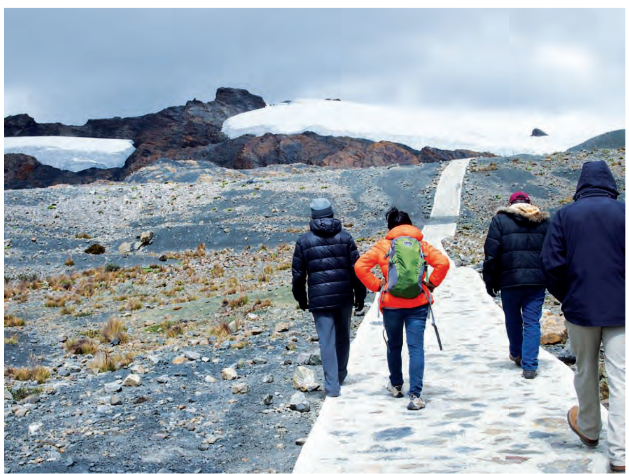
Figure 2. Visitors to the receding Pastoruri Glacier in 2014 in the Cordillera Blanca of Peru. They are on a day trip with a climate change motif.

to both climate warming and volcanism; Ramírez et al. (2001) documented the disappearance of small glaciers in Bolivia; Jomelli et al. (2011) examined glacier retreat over the Holocene for the Cordillera Real of Bolivia, with especially rapid loss in the last century and linked to warmer atmospheric and Pacific Ocean temperatures; López-Moreno et al. (2014) reported a 56% decrease in glacial cover and an increase in size of glacial lakes in central Peru; and Ceballos et al. (2006) described how important scale-and edge-related effects were acting on the cryosphere of Colombia, making the smaller glaciers there melt especially quickly.