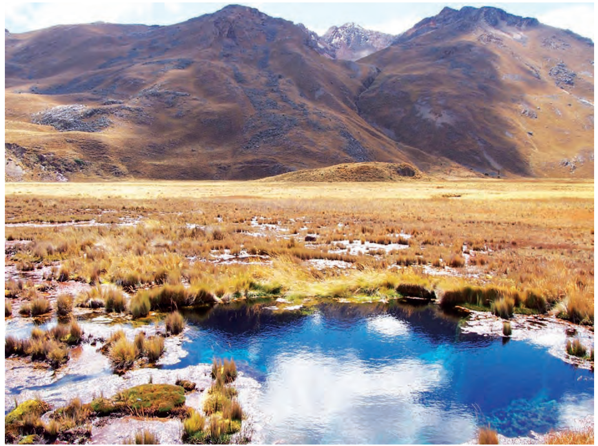
Figure 3. Wetlands and ponds in the valley bottoms of the Cordillera Blanca of Peru.

Observations in southern Peru have been made on primary succession near the Quelccaya Ice Cap and on the Vilcanota Cordillera. Freeman et al. (2009) found that saturated periglacial soils were dominated by chytrid fungi (Chytridiocycota), which presumably carry out decomposition. Those fungal communities are similar to those found in other similar sites worldwide, and all evidence points to the importance of fungi, and also algae and microbes, for primary succession following deglaciation (Freeman et al. 2009, Schmidt et al. 2012, 2014).