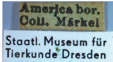
Figure 5. Labels on the type specimen of Litargus quadrimaculatus Kirsch.