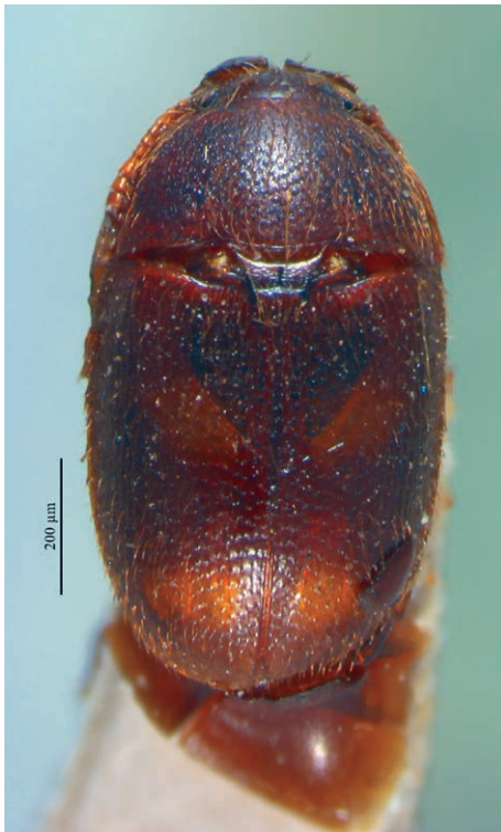
Figure 4. Type specimen of Litargus quadrimaculatus Kirsch.

PERU: Tambopata Prov. / 15 km NE of Pto. Maldonado / 17 July, 200 m / J. Ashe, R. Leschen #537 / ex. Thelphoracue (SEMC, 1)