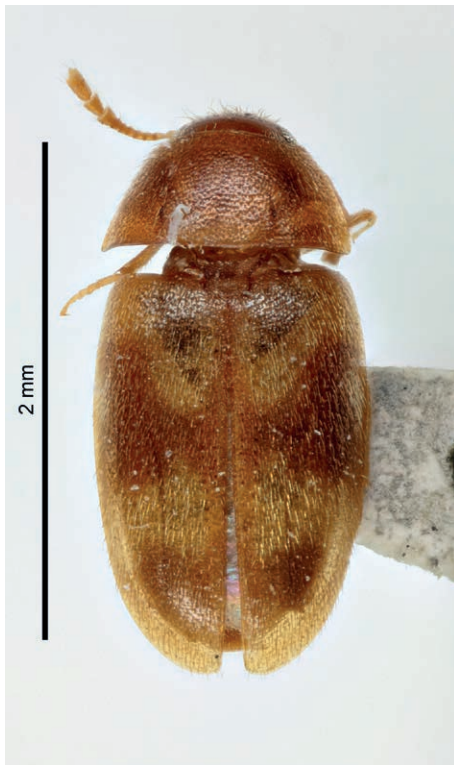
Figure 1. Syntype of Litargus arcuatus Erichson.