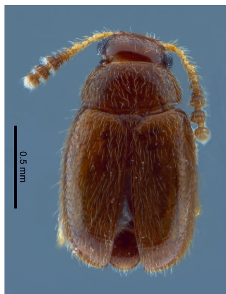
Figure 7. Thrimolus , dorsal habitus.