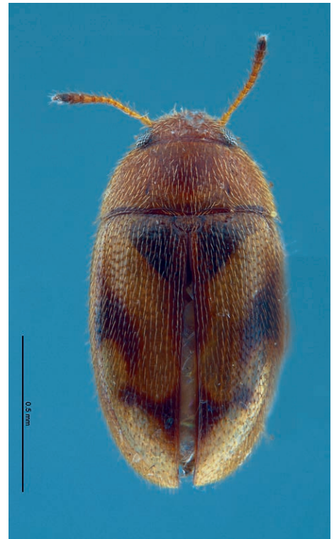
Figure 3. A recent specimen of Litargus arcuatus Erichson, dorsal habitus.