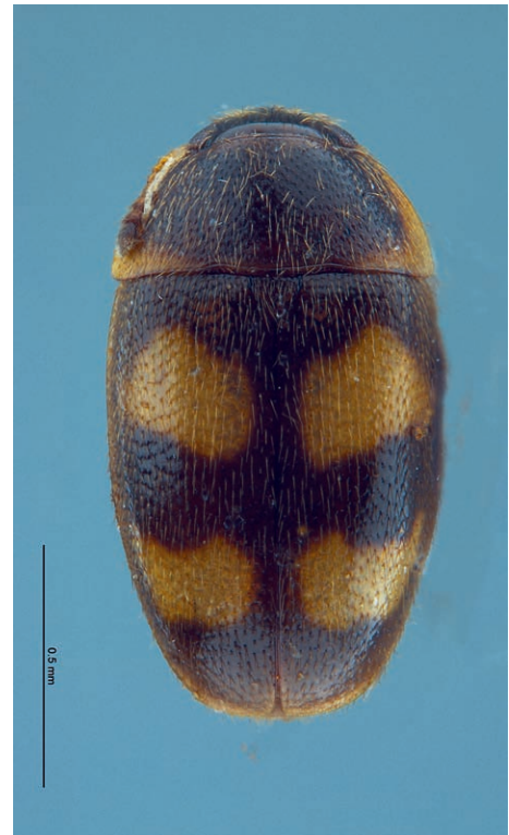
Figure 6. A recent specimen of Litargus quadrimaculatus Kirsch.